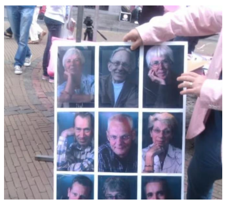
Example of role modelling type education: "Who is the hetero?" public quiz in Utrecht, 2012 (https://www.duic.nl/cultuur/wie-is-de-hetero/)

tolerance for it), there is a risk that the young people are confirmed in their prejudices ("you see, they are different/weird"). This potential affirmation of prejudice can be corrected by making the role models as real and authentic as possible. But even then there is still a risk that young people will regard the various role models shown as good exceptions to the rule ("I now know you personally are OK, but I think LGBTIQ in general are still weird"). The role model approach is therefore very vulnerable to pitfalls. GALE decided to "play" with imagery, but not to use the displayed images as role modelling in the sense of Bandura or the intergroup contact theory.